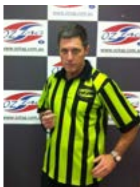
Late Tag – Stage 1