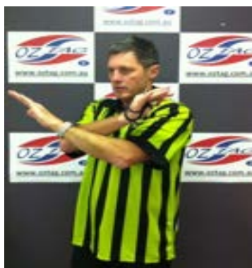
End of game – Stage 1