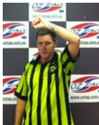
6 again – Stage 1