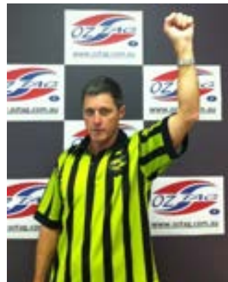
6 again – Stage 2