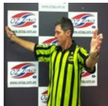
Off Side – Stage 3