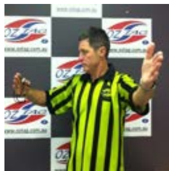
Off Side – Stage 2