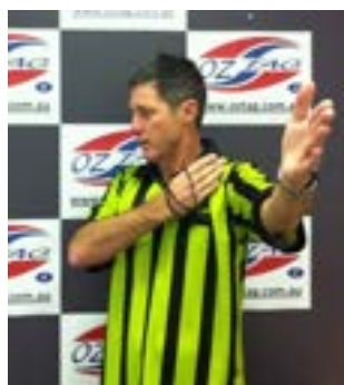
Off Side – Stage 1