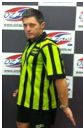
Fend – Stage 3