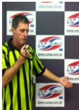
Forward pass – stage 1