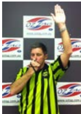
Stop play – Stage 1