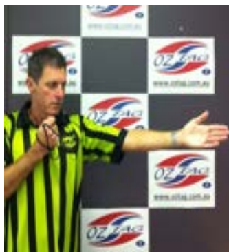
Forward pass – stage 2