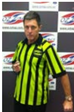
Late Tag – Stage 2