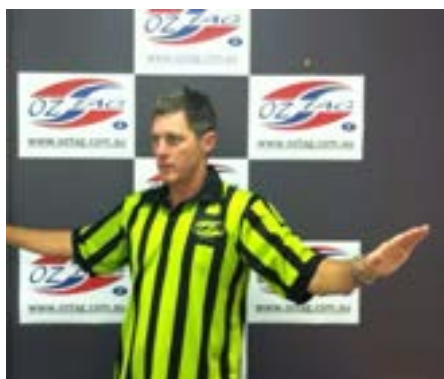
End of game – Stage 2