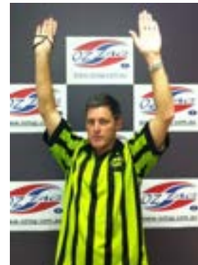
Stop play – Stage 2