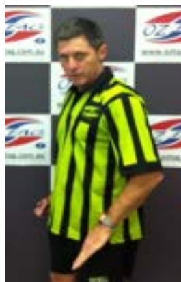
Fend – Stage 2