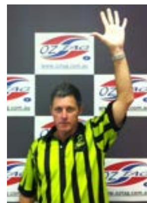
5 th & last