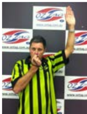
Kick off – commence game