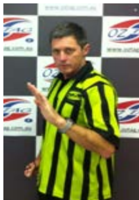
Fend – Stage 1